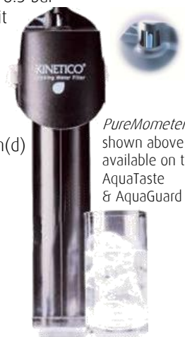
PureMometer™ shown above available on the AquaTaste & AquaGuard filter